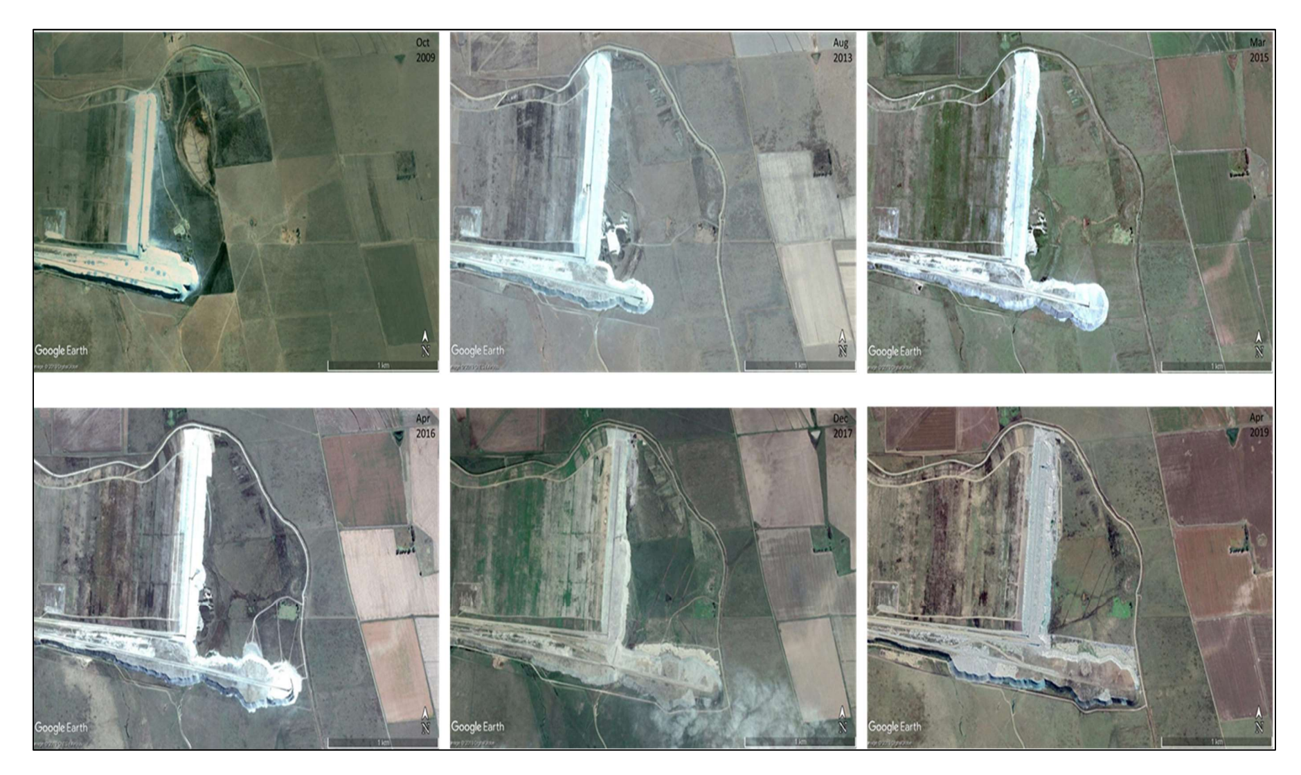
Figure 5.2: Historical aerial images of the ADF showing the advancement between October 2009 and April 2019.